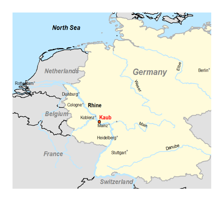
Figure 1: Map of the Rhine river and location of the gauging station Kaub.