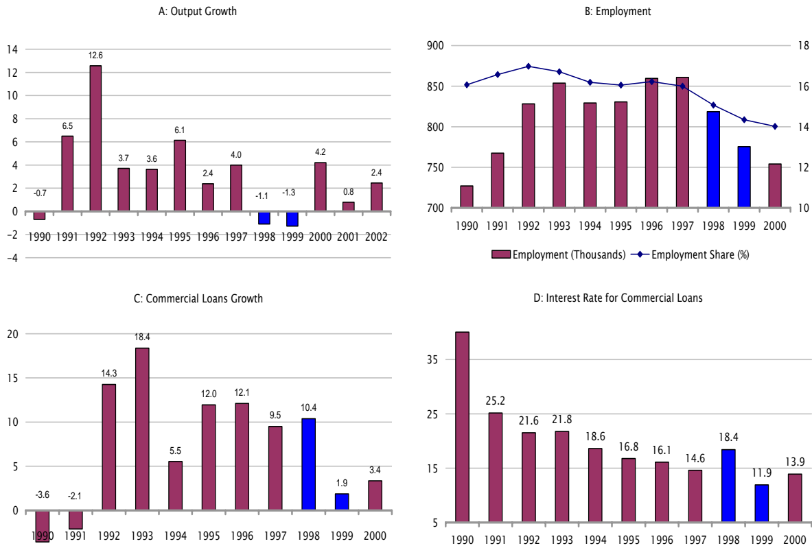
Figure 2: Manufacturing and Financial Indicators. 1990-2000

Source: Chilean National Institute of Statistics and Central Bank of Chile